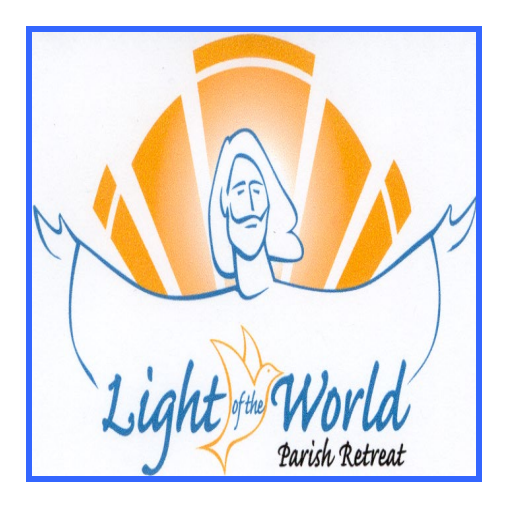
Behold, I stand at the door and knock. If anyone hears My voice and opens the door, I will come unto him and dine with him and he with Me. ~ Revelation 3:20